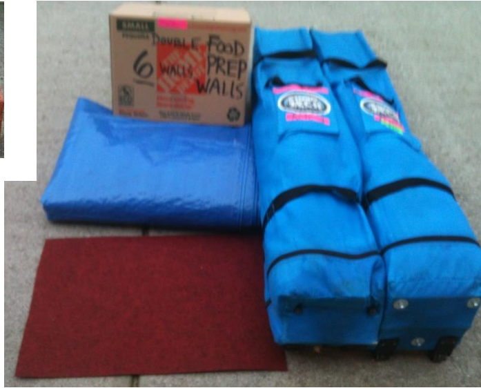
Double (10 x 20)