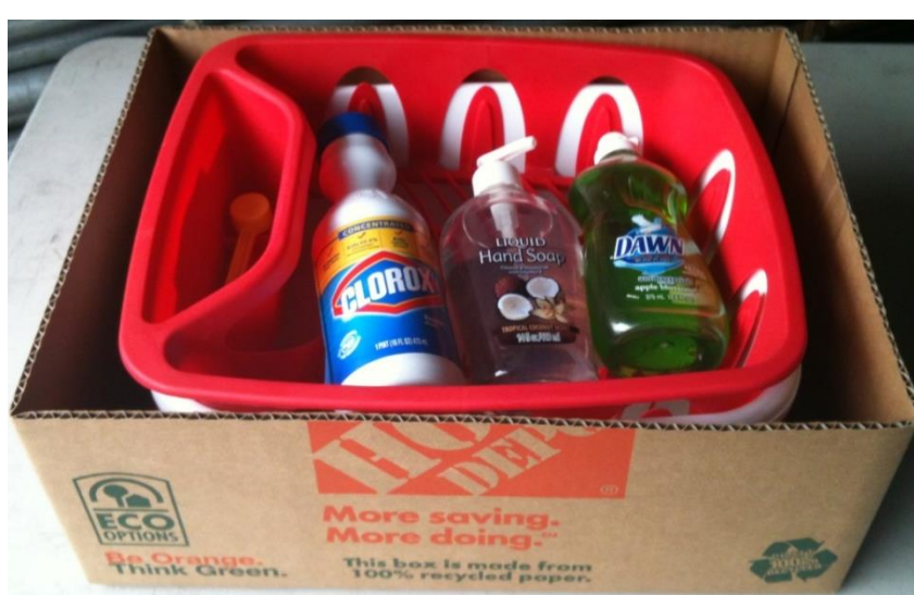
Wash Pan Sets (all sets come inside 2 boxes) (includes Permits packs)