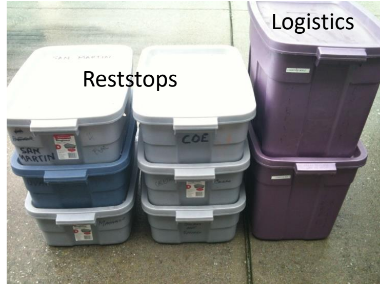
Site Supply Boxes - Trash bags, tools, sharpies, tape, sunscreen, etc