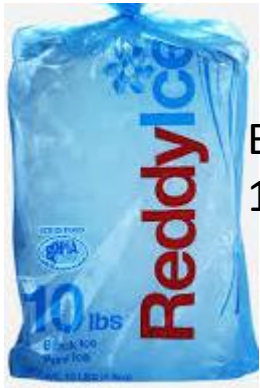
Block ice 10 lbs