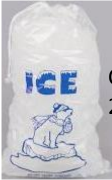
Crushed ice 20 lbs