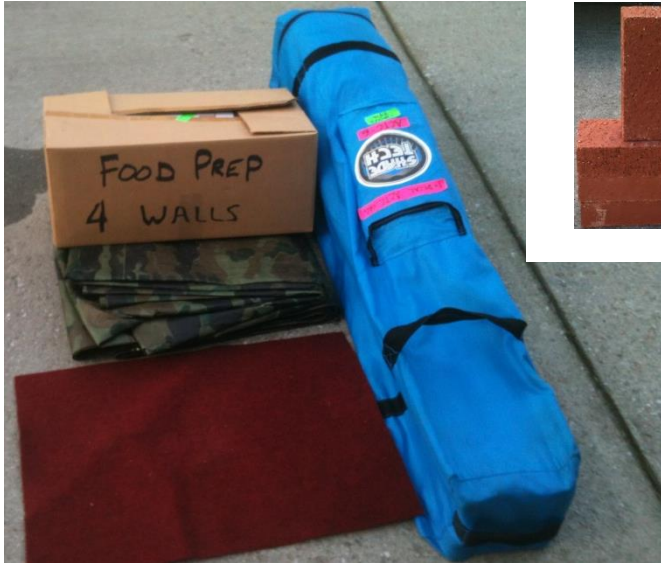
Single (10 x 10)